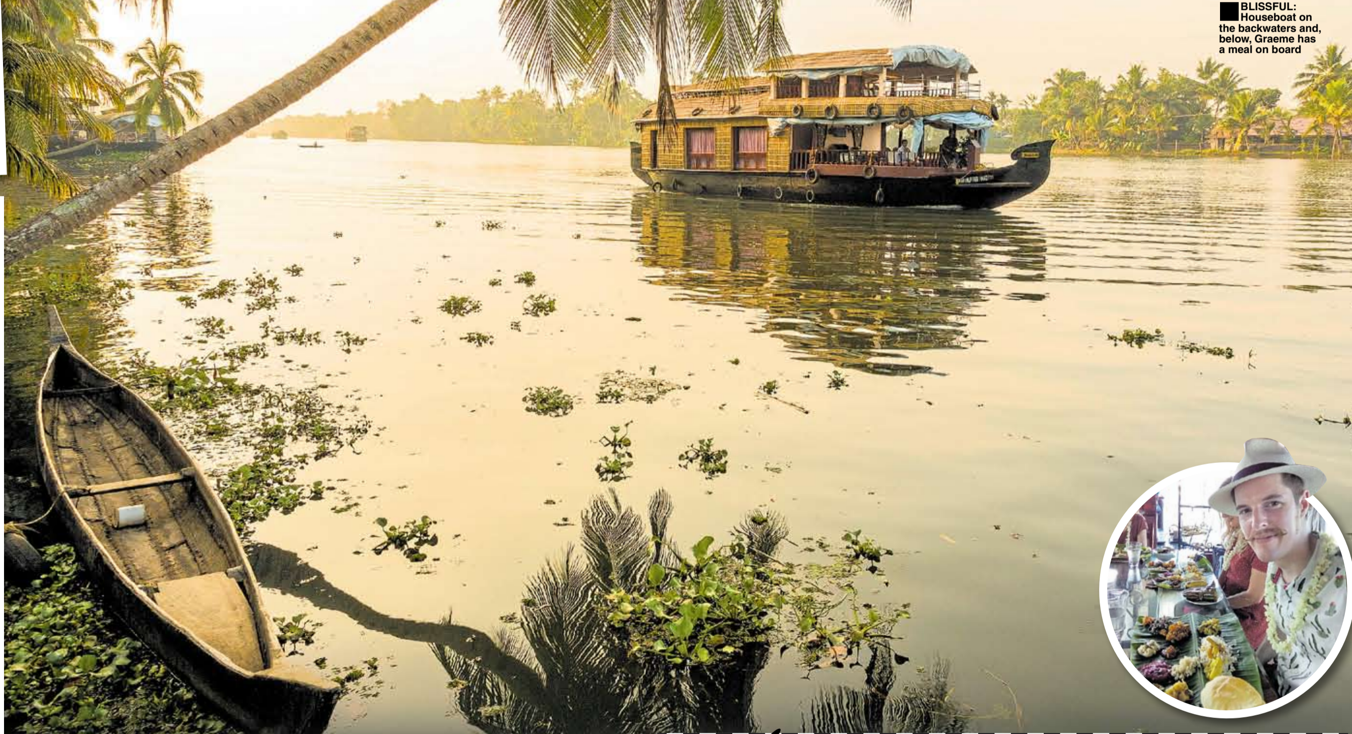
BLISSFUL: Houseboat on the backwaters and, below, Graeme has a meal on board

TUK-TUKS dart past in a blur, bikes weave around criss-crossing pedestrians, and free-roaming cats and hens scatter every which way.