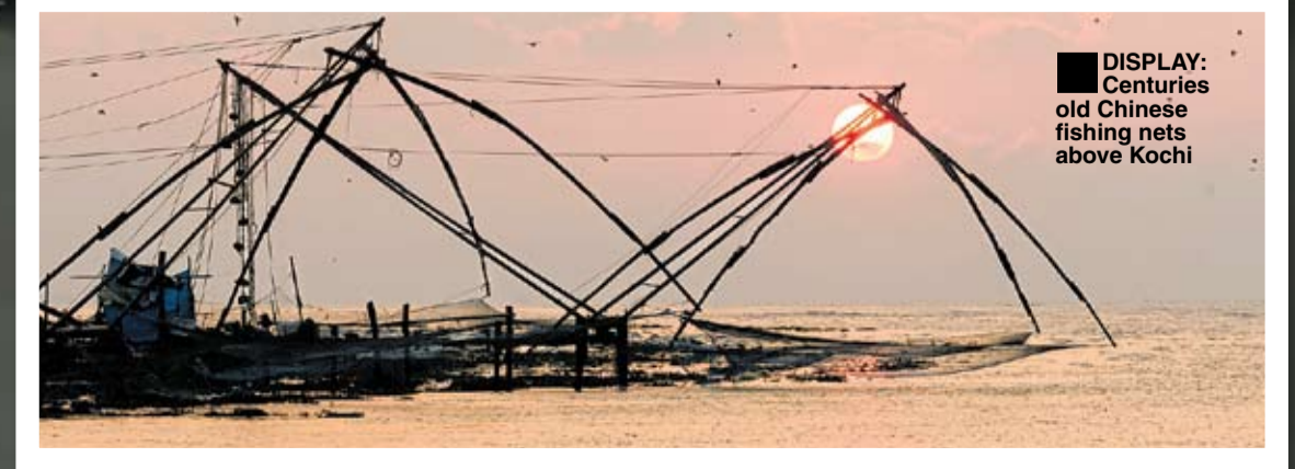
DISPLAY: Centuries old Chinese fishing nets above Kochi